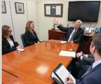
Members from Rhode Island meet with Sen. Sheldon Whitehouse (D-RI).