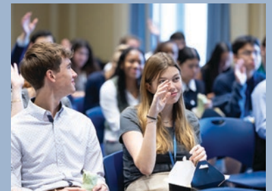
Congressional staff attend and participate in a CICC Capitol Hill briefing.