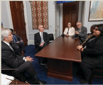
Members from Oregon meet with Rep. Cliff Bentz (R-OR).