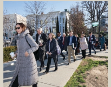
NAICU members head to Capitol Hill for Advocacy Day meetings with their congressional delegations.