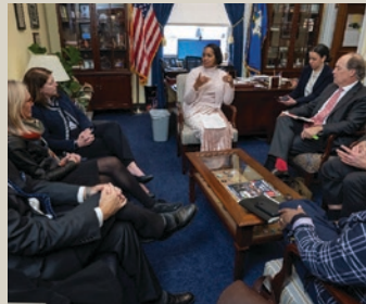
Members from Connecticut meet with Rep. Jahana Hayes (D-CT).