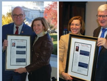
CICC members Reps. James McGovern (D-MA) and Glenn Grothman (R-WI) are recognized as CICC Members in the Spotlight.