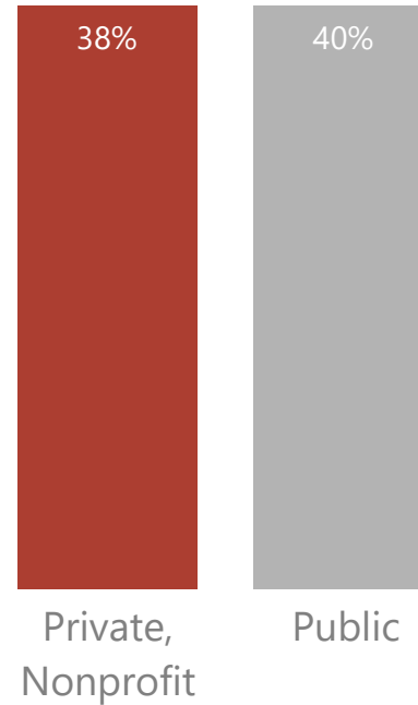
Share of Students at 4-Year Colleges That Are Pell Grant Recipients, 2019-20